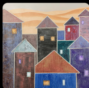
Communal Harmony By: Segun Aiyesan