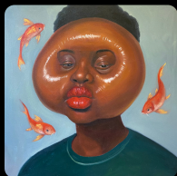
Aro Metta By: Segun Caezar