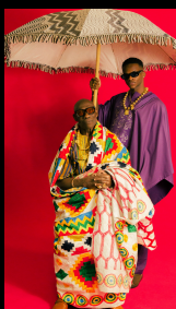
What We Carry Forward By: Enoch Oppong